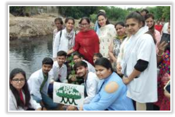
Plants for the planet-Planting trees in and around the campus