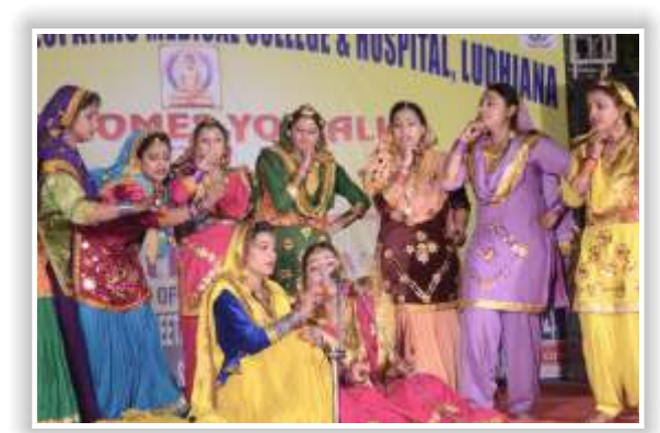
Cultural Programme at Annual Meet