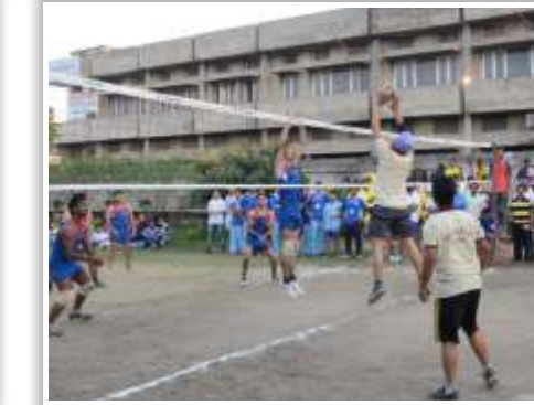
Inter-college Sports Meet