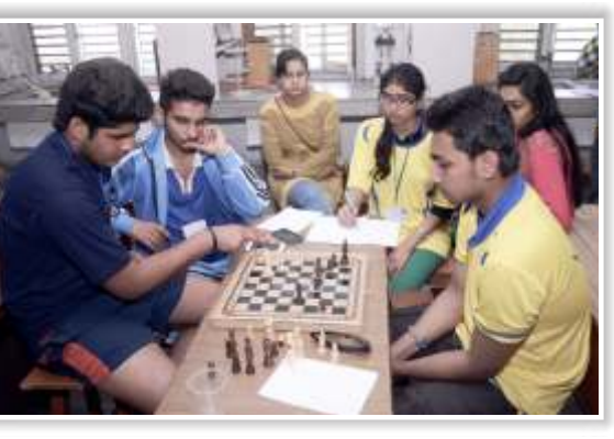
Chess Competition at Inter-college Sports Week